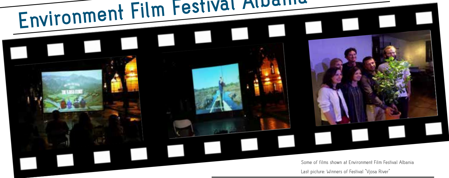
Some of films shown at Environment Film Festival Albania Last picture: Winners of Festival "Vjosa River"

Albania hosted its fourth successive Environment Film Festival. The festival was held from 22 May-5 June 2016 across eight locations: Shkodra, Tirana, Vlora, Skrapar, Permet, Erseke, Gjirokaster and Valbona. Ecology, culture, economy, migrations, wars and social issues, among many others, provided the essence to this festival, aimed at sharing and exchanging common and future concerns. More than 70 films from more than 40 countries were shown at EFFA. Five of them featured stories about lakes around the world and importance on protecting their ecosystem and wildlife, such as