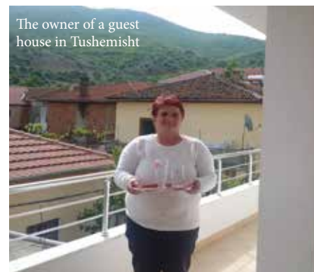
The owner of a guest house in Tushemisht

workshop on promoting nature, culture the Lake Ohrid region took place in Tushemisht on 10 and 11 May 2016 and some workshop participants stayed in quest houses. The hosts provided doughnuts, homemade jams, butter and cheeses for breakfast. Language barriers presented no difficulties as they were overcome with smiles and warm hospitality. The traditional restaurant Lokali Zonja nga Qyteti in the centre of Tushemisht is also owned by a woman and is a real hit with locals and visitors alike. One can enjoy lakror, a traditional pie made with layers of pastry, herbs and vegetables, along with meatballs and pickles as side dishes. Local drinks include wine and raki, with one special green variety coloured by apple leaves that provide a unique flavour. Three ladies, including the owner, rolled up their sleeves to prepare the lakror for the dinner of the workshop participants. The lakror was greatly appreciated by locals and internationals. Guests felt instantly at home at this little village, thanks to the warmth and hospitality of these women of Tushemisht.