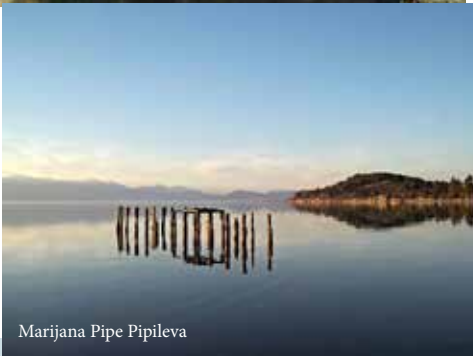
Marijana Pipe Pipileva