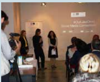
Awards ceremony at Palace of Culture, Pogradec