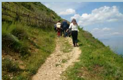
Training Participants visiting the castle of Pogradec