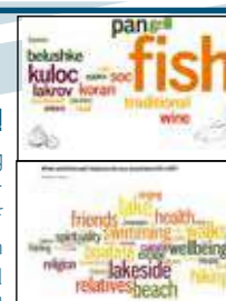
Activities associated with Lake Ohrid Region Culinary and agriculture in LOR