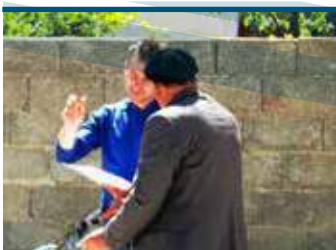
The journalist talking to a local in Hudenisht

Some ten percent of local residents benefit in one way or another from business and employment opportunities connected with tourism. Visitors to the Lake Ohrid region seem to be largely domestic and, together with local residents, they identified a range of positive experiences related to the cultural and natural landscape. The results of this modest campaign demonstrate the importance of more substantial public consultation in the future to inform decision making for managing the Lake Ohrid region's heritage and promoting it as a tourism destination.