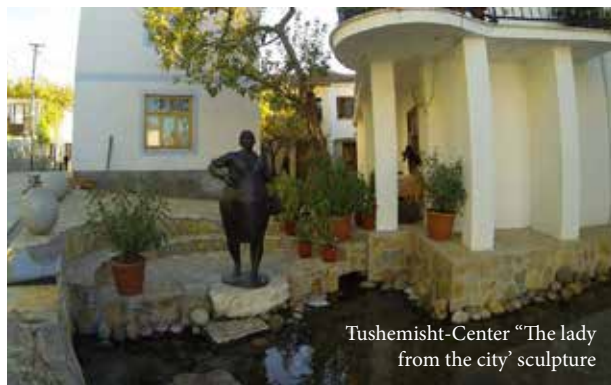
Tushemisht-Center "The lady from the city" sculpture

"A perfect mix of warm hospitality and total privacy for quests. Immaculately clean. In such a quiet timeless village centre you could only hear the spring water flowing in the canals through the streets at night. The best breakfast I have eaten in years, simple but truly excellent local produce" Jane Thompson, ICCROM