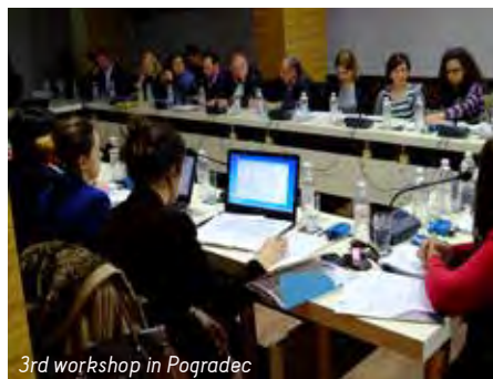
3rd workshop in Pogradec

Representatives from both countries participated in the workshop, including national authorities from the respective ministries of environment and culture, local authorities from the municipalities of the Lake Ohrid region, Advisory Bodies to the World Heritage Committee (ICCROM, ICOMOS and IUCN) as well as a representative from UNESCO.