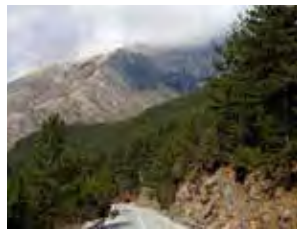
View from a forest in Albania

Pogradec inherits a tradition and obligation to conserve and protect Lake Ohrid. Our citizens have always seen the lake as a valuable resource, and have treated it as a gift from God. A network of local environmental NGO-s was established during 1996-2004, under the Regional Environmental Centre in order to raise public awareness and participation, thus becoming a factor and a partner of the municipality in decision making for the region of Lake Ohrid. We also consider as a necessity the cross-border cooperation. Together with municipalities of Struga and Ohrid we signed a Memorandum of Understanding in Wismar and another on technical cooperation, will be signed in Ohrid. This is the only way to ensure sustainable development of the Lake, inspired by the motto "One lake, one vision, one future"