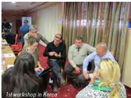
1st workshop in Korca

At the meeting stakeholders presented the state of the cultural and natural heritage in the Lake Ohrid region, with particular focus on the existing management structures and planning processes in two participatory working sessions. Two main participatory working sessions focused on undertaking a thorough stakeholder analysis, the first session with a thematic approach based on the key themes of the project (waste, sustainable tourism, urban development and spatial planning, civil society and communities), while the second involved group work focused on nature and culture. The mixed composition and size of the groups enabled dialogue across the various sectors and an integrated review of stakeholders present in the Lake Ohrid region.