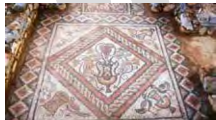
Lin Mosaic, Pogradec

Albanian National Council for Restoration at Ministry of Culture defined the Buffer Zone for protecting cultural heritage in the area of Lin Village Pogradec.