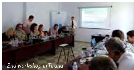
2nd workshop in Tirana

statements led to a single statement, which will be fine-tuned over the course of the management planning process for the World Heritage extension project. The workshop also focused on mapping, improving knowledge of the area and understanding the different factors affecting the area, in particular ongoing and future projects and initiatives that may have an impact on the Lake Ohrid region and the potential transboundary World Heritage property.